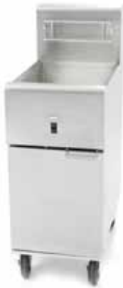
SR14E Shown with optional casters.